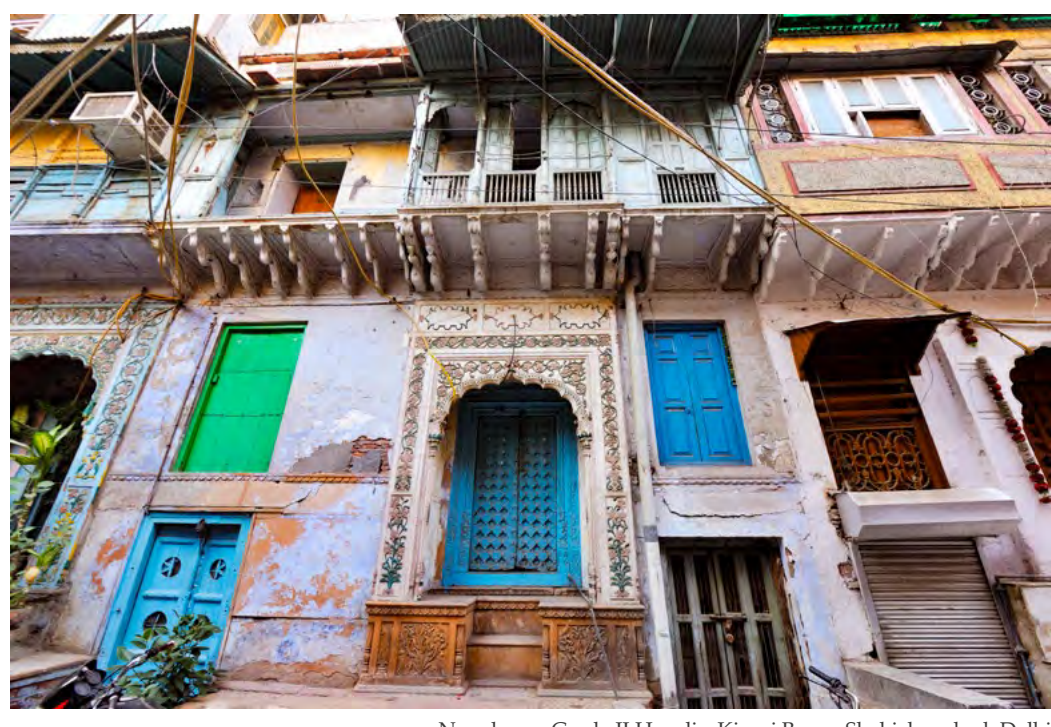
Naughara - Grade II Havelis, Kinari Bazar, Shahjahanabad, Delhi Please refer Page 312 for a Grade III Haveli