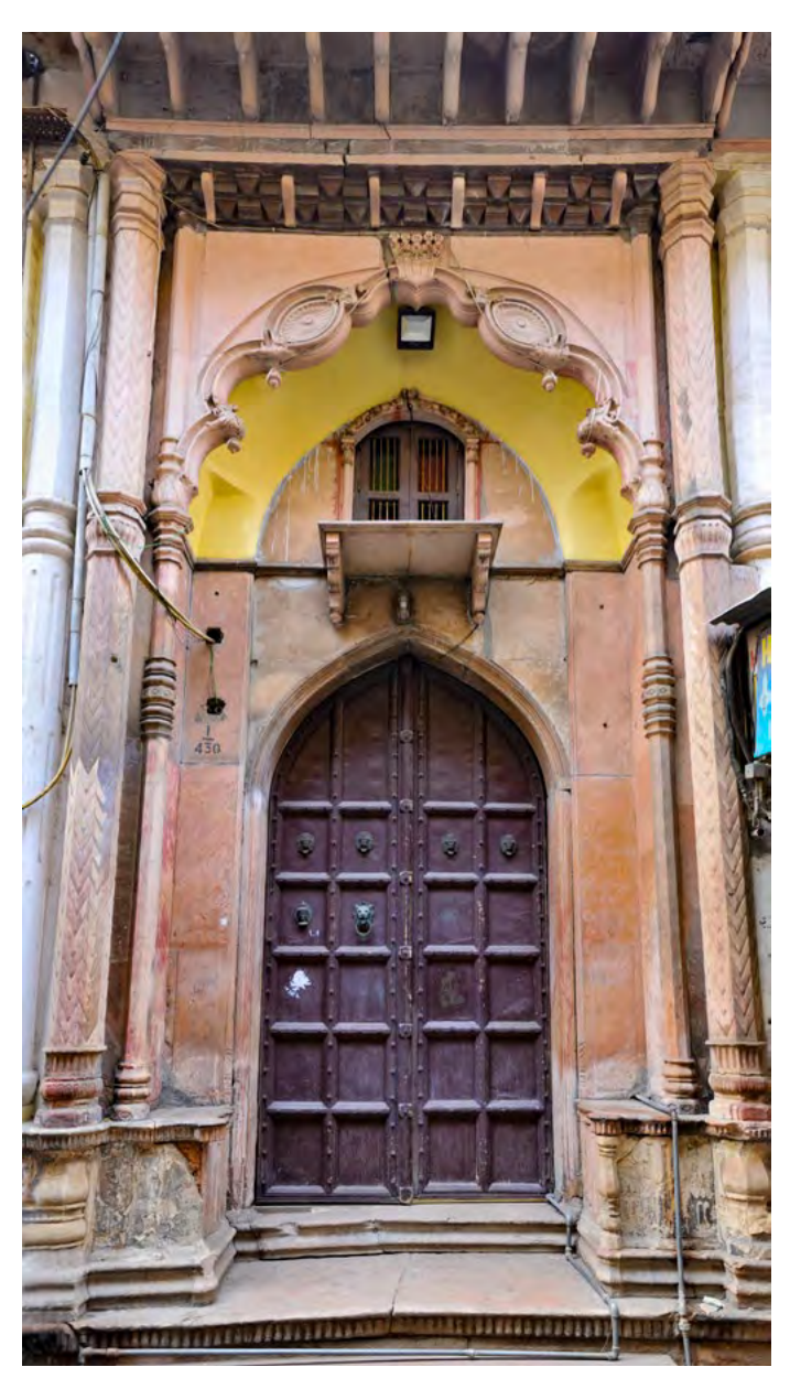
Seth Ramlal Haveli, (Grade II), Kashmere Gate, restored for residential use

Sale and purchase of Heritage Buildings does not require any permission from Municipal Corporation of Delhi/ Delhi Development Authority/ New Delhi Municipal Council or Heritage Conservation Committee. The Regulations do not affect the ownership or usage. However, such usage should be in harmony with the said listed precincts/ buildings.