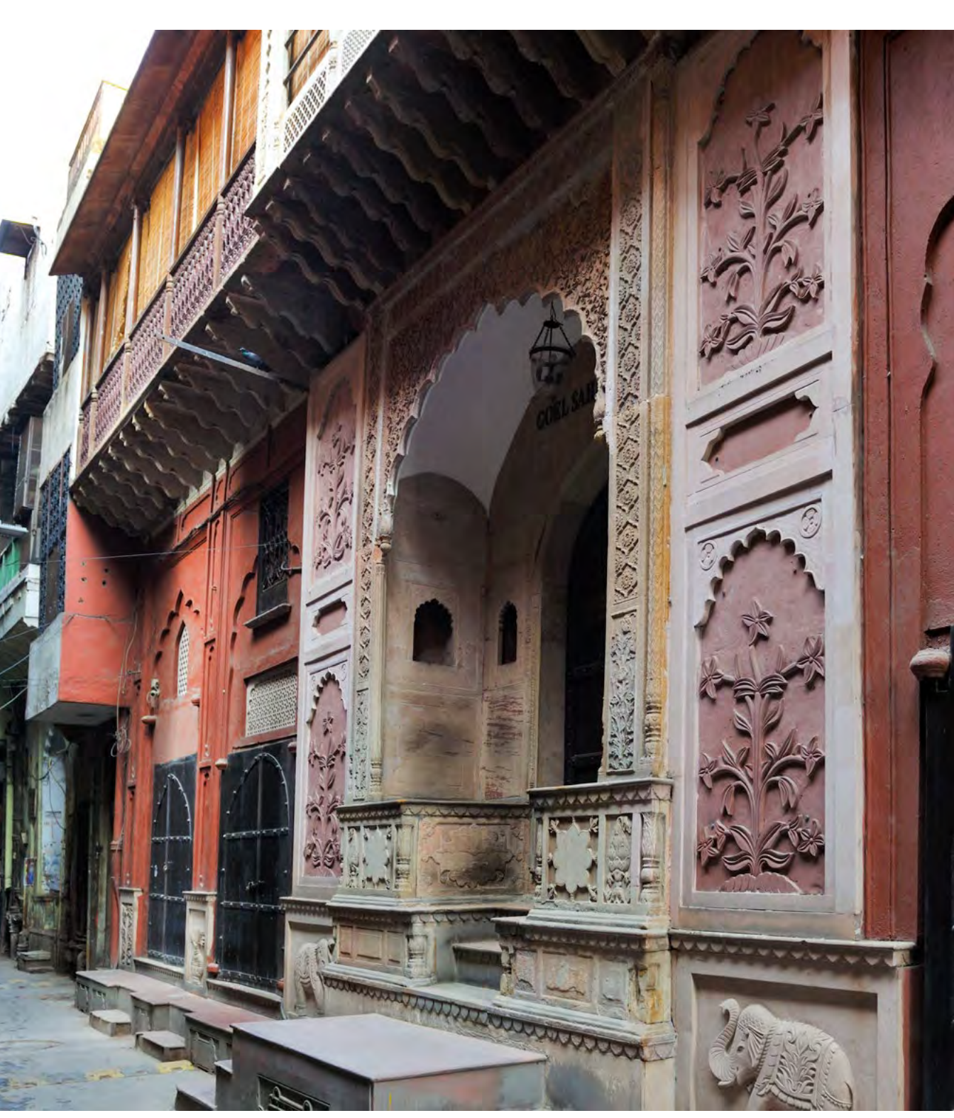
Dharampura Haveli, (Grade II), Shahjahanabad, first Haveli to be restored for adaptive re-use